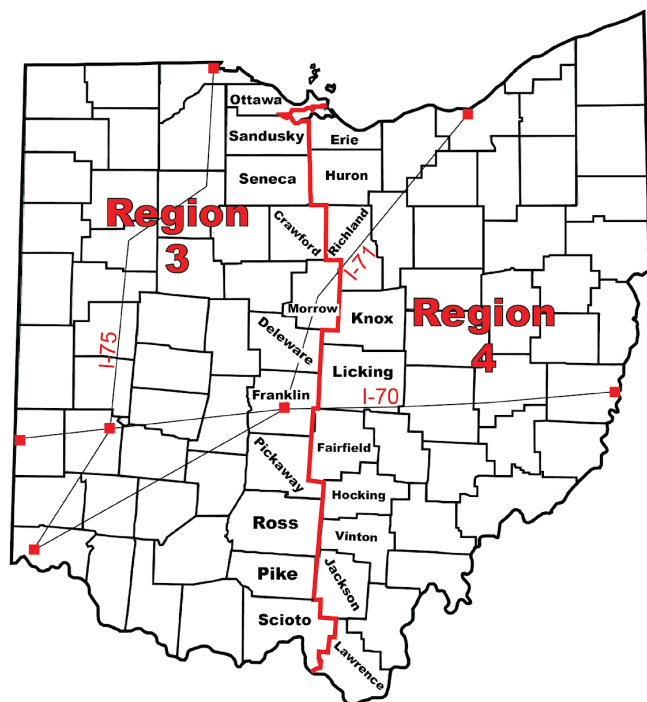
Exhibit B - SAY Ohio Regional Map